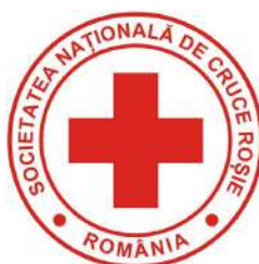
Romanian Red Cross Society