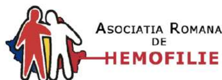
Asociației Române de Hemofilie