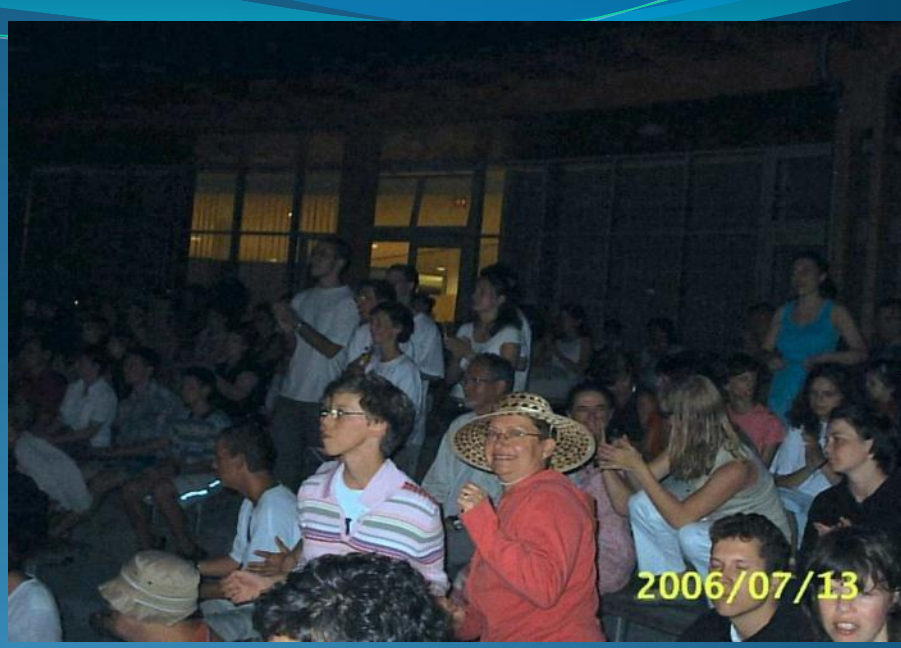
Presentation of countries