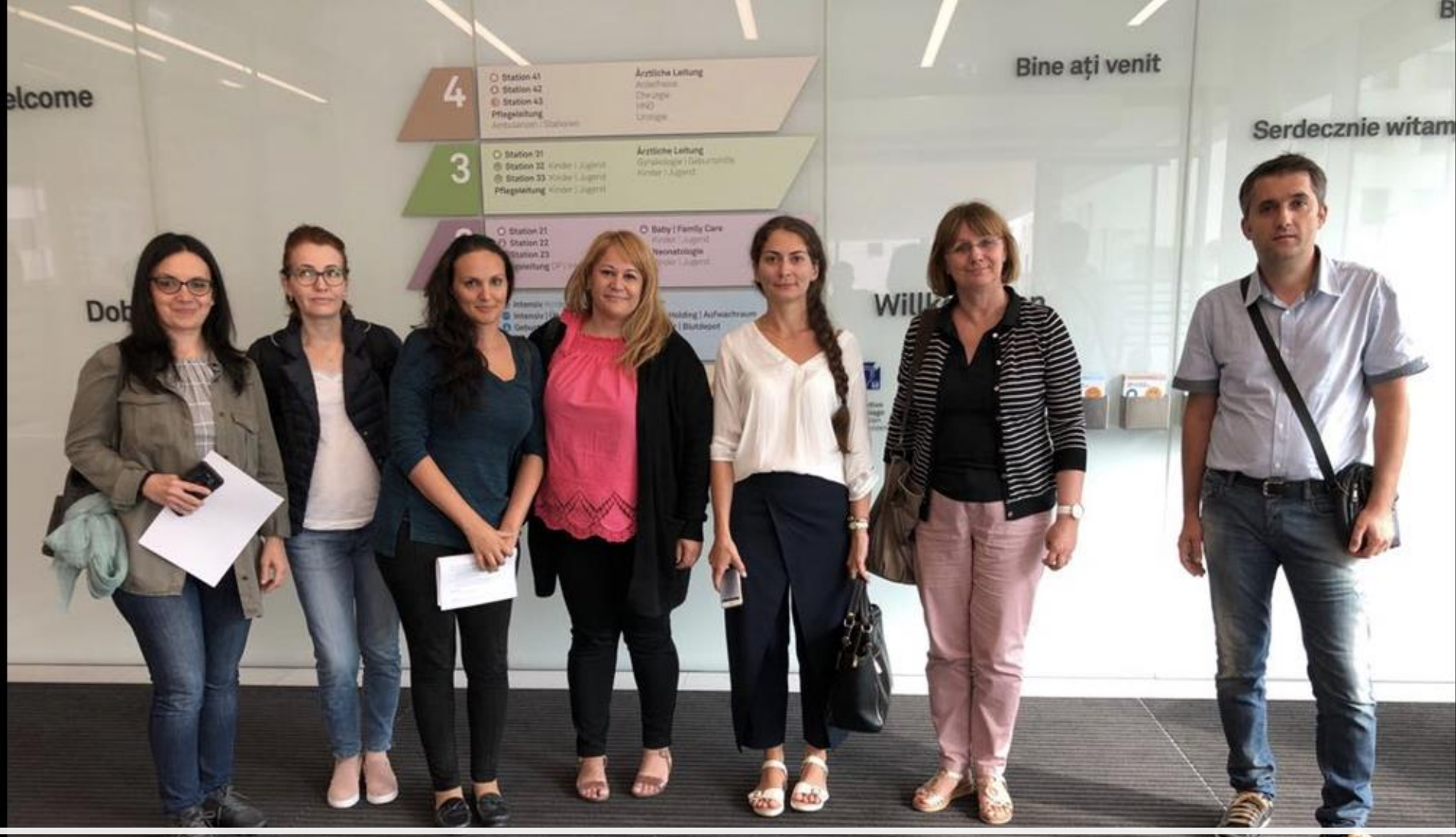
ROMANIAN PHYSICIANS TRAINED IN WIEN, KAISER HOSPITAL